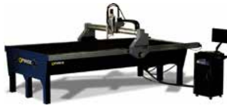
CAPTAIN Industrial Medium-Duty System