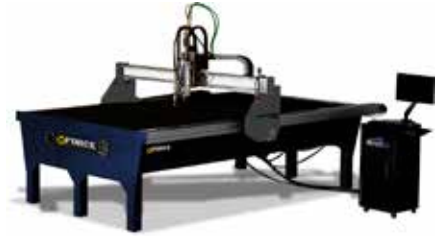
ADMIRAL Industrial Medium-Duty+ System