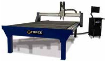
COMMANDER Industrial Light-Duty System